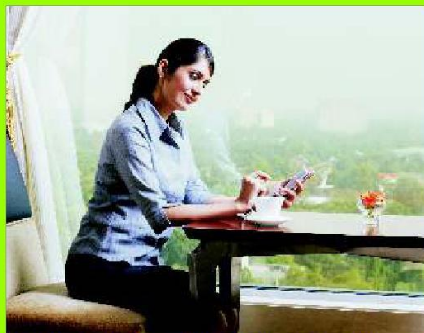
Greater daylight penetration for buildings with scenic beauty to relish