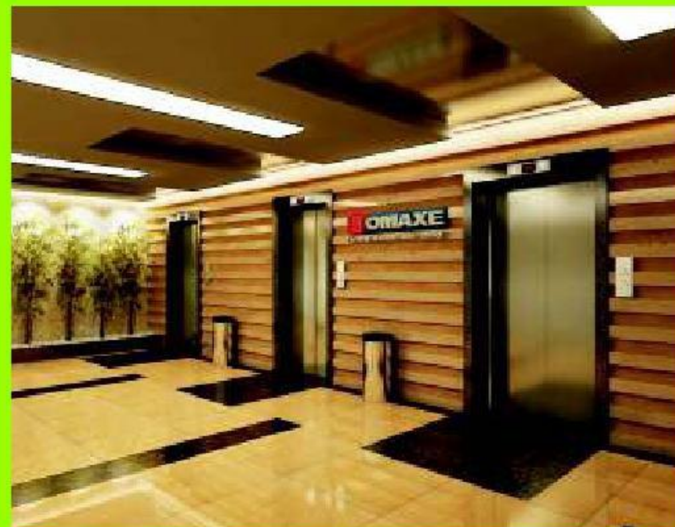
Efficiently organized core and flexible lift clusters connecting 19 magnificent floors