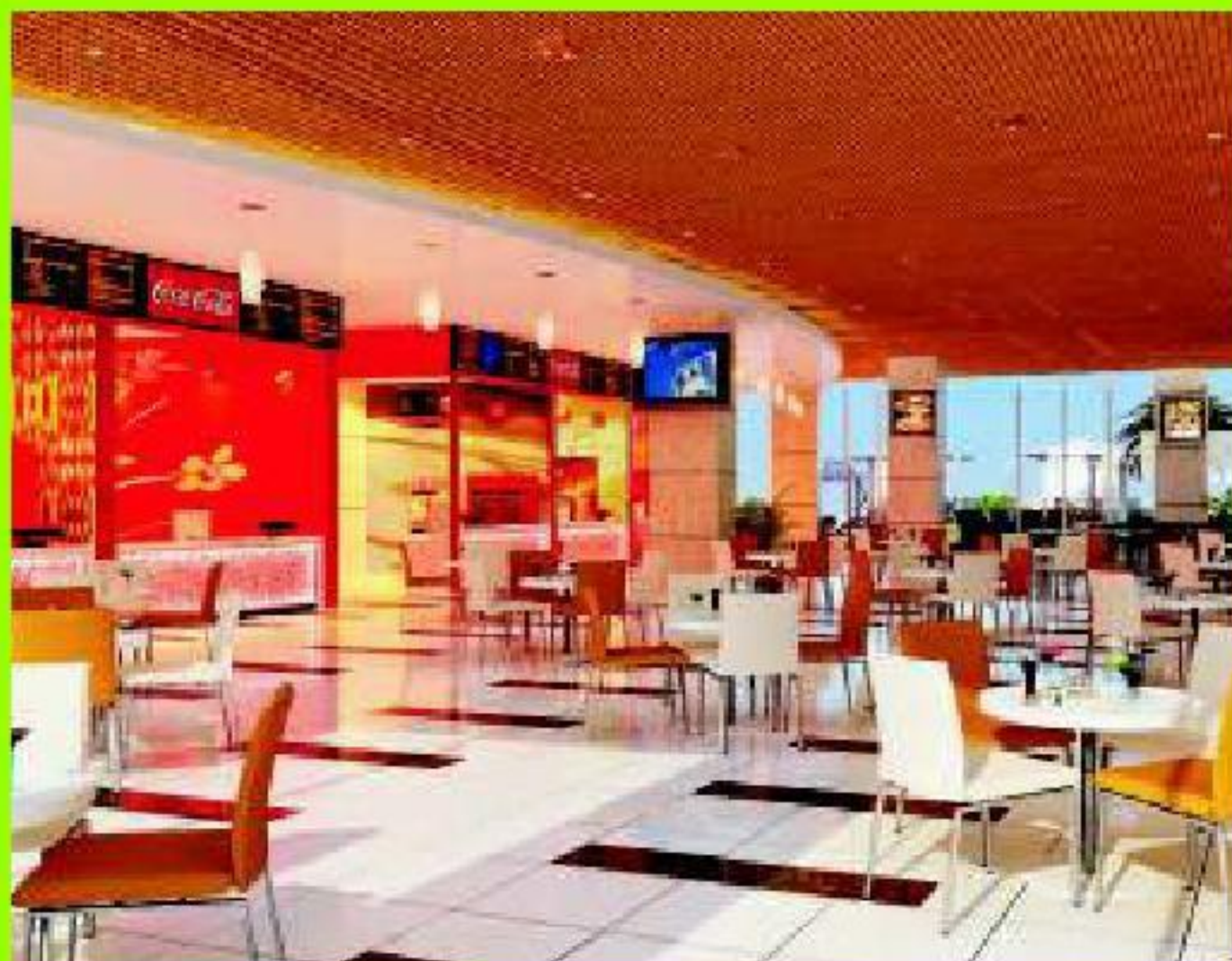
Food courts rich flowing with delicious recipes to help you re-collect yourself

document provided by Anurag Malik 9888-88-3886 www.BuyChandigarh.com