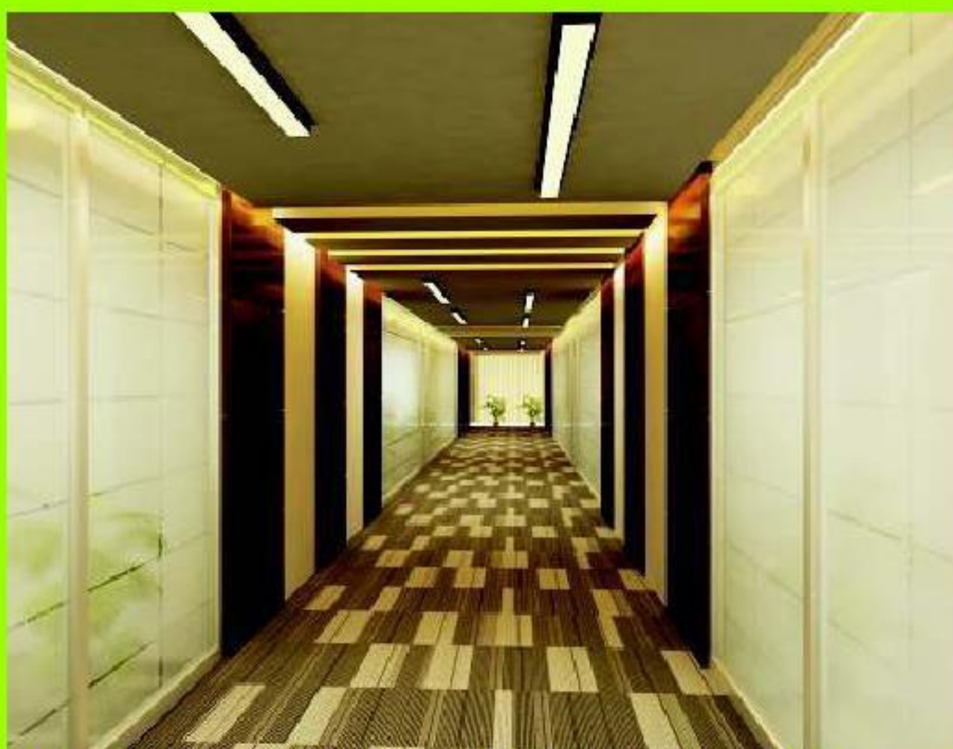
Grand passages that provide fluency to walk-ins and outs