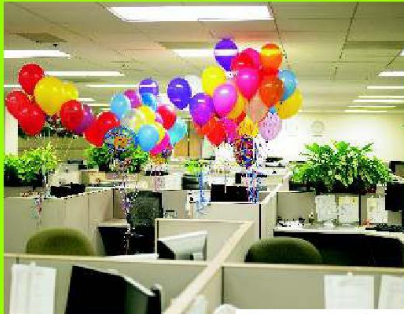
Office spaces so comfortable workaholic