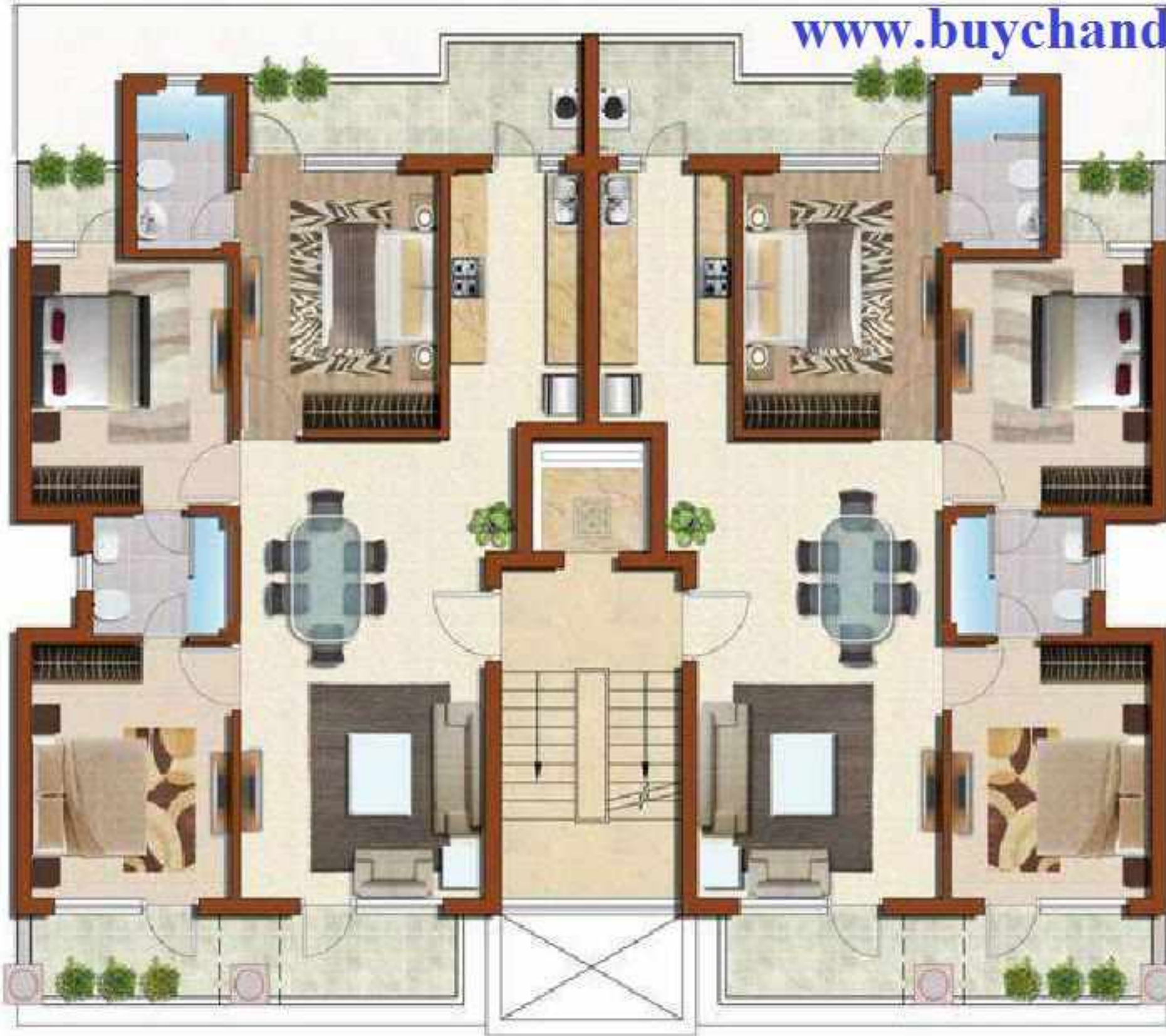
FIRST FLOOR PLAN SALEABLE AREA/ UNIT: 1415 SQ.FT.