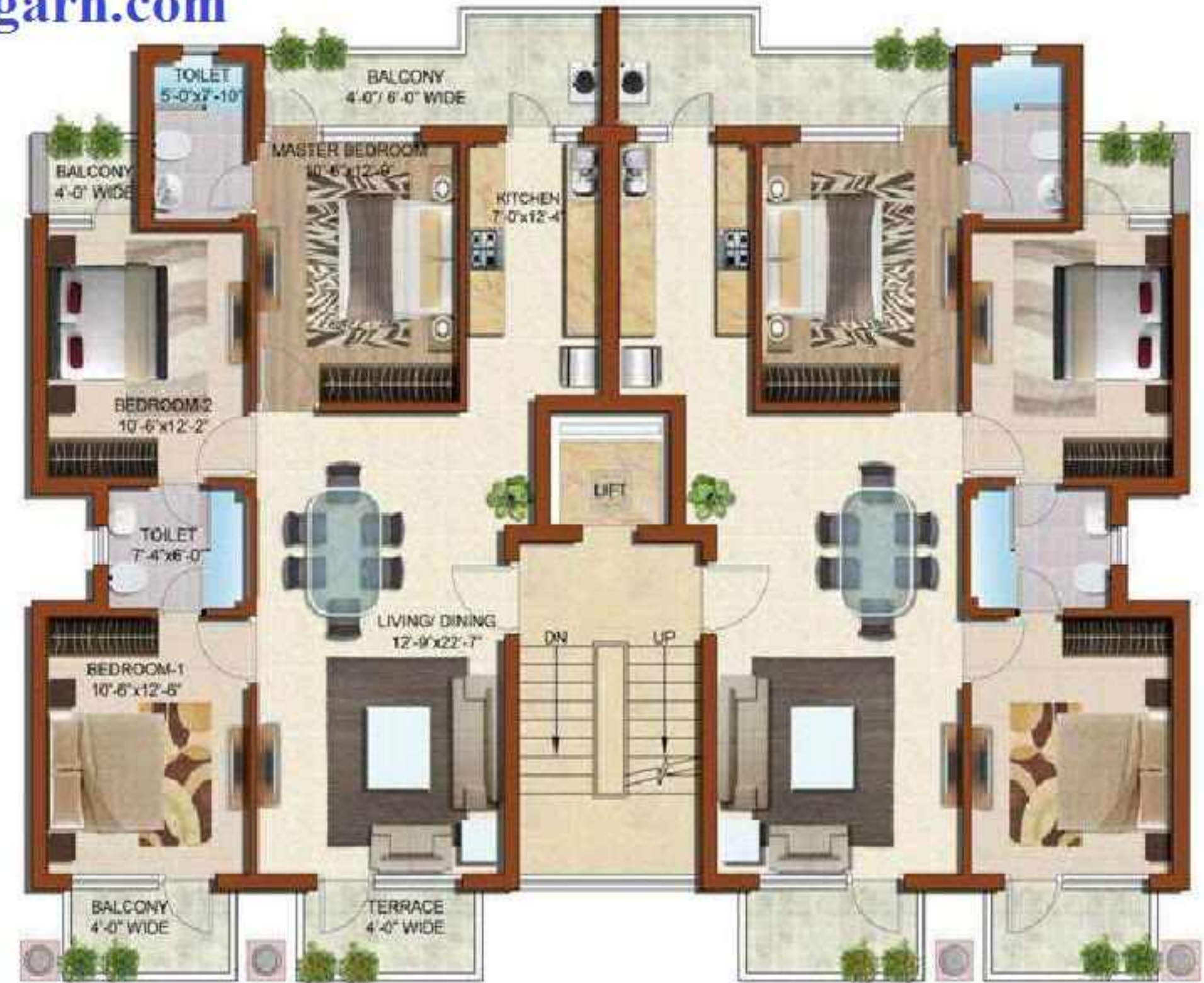
SECOND FLOOR PLAN SALEABLE AREA/ UNIT: 1415 SQ.FT.