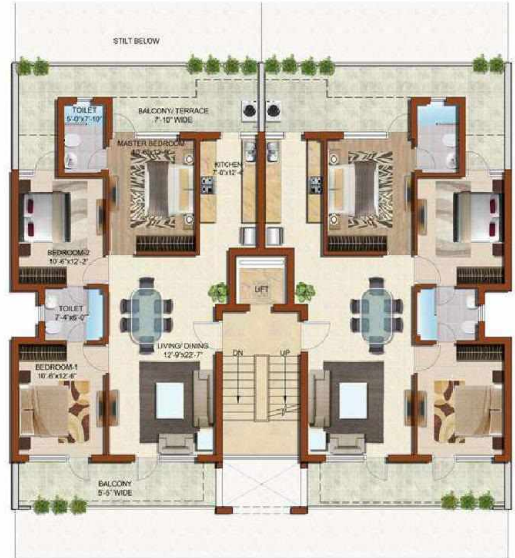
UPPER GROUND FLOOR PLAN