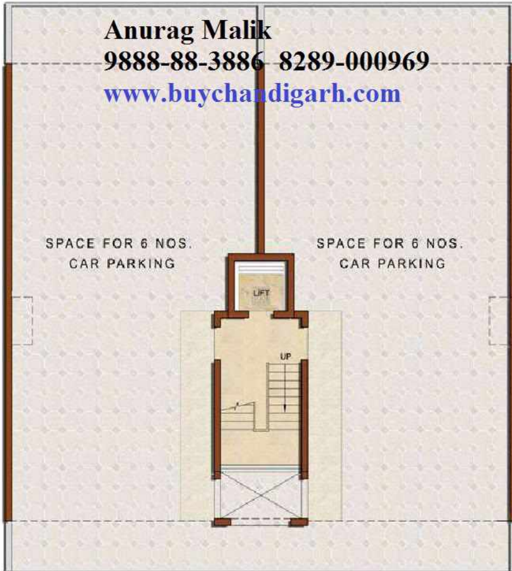
STITL FLOOR PLAN