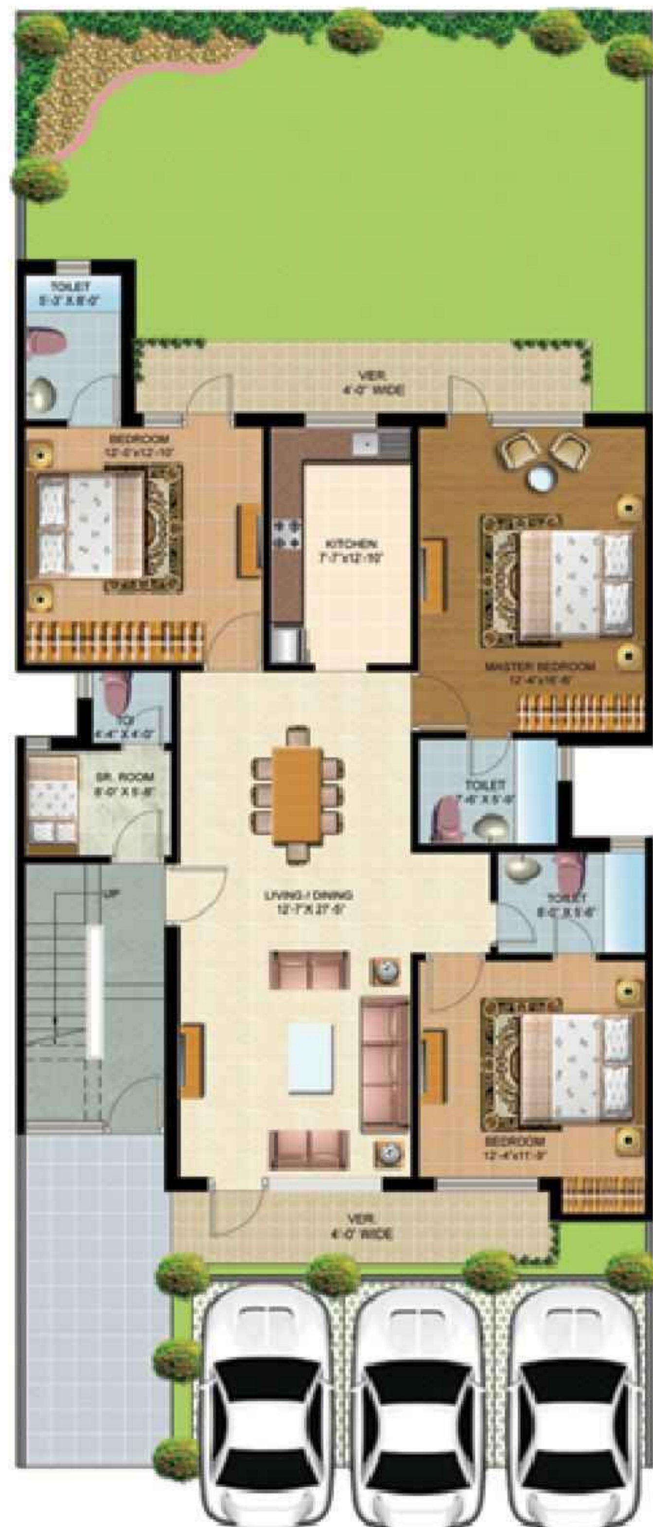
GROUND FLOOR PLAN SALEABLE AREA: 1725 Sq. Ft.

4 BHK + Servant Independent Floors in 2200 Sq. Ft. (400 Sq. Yds.)