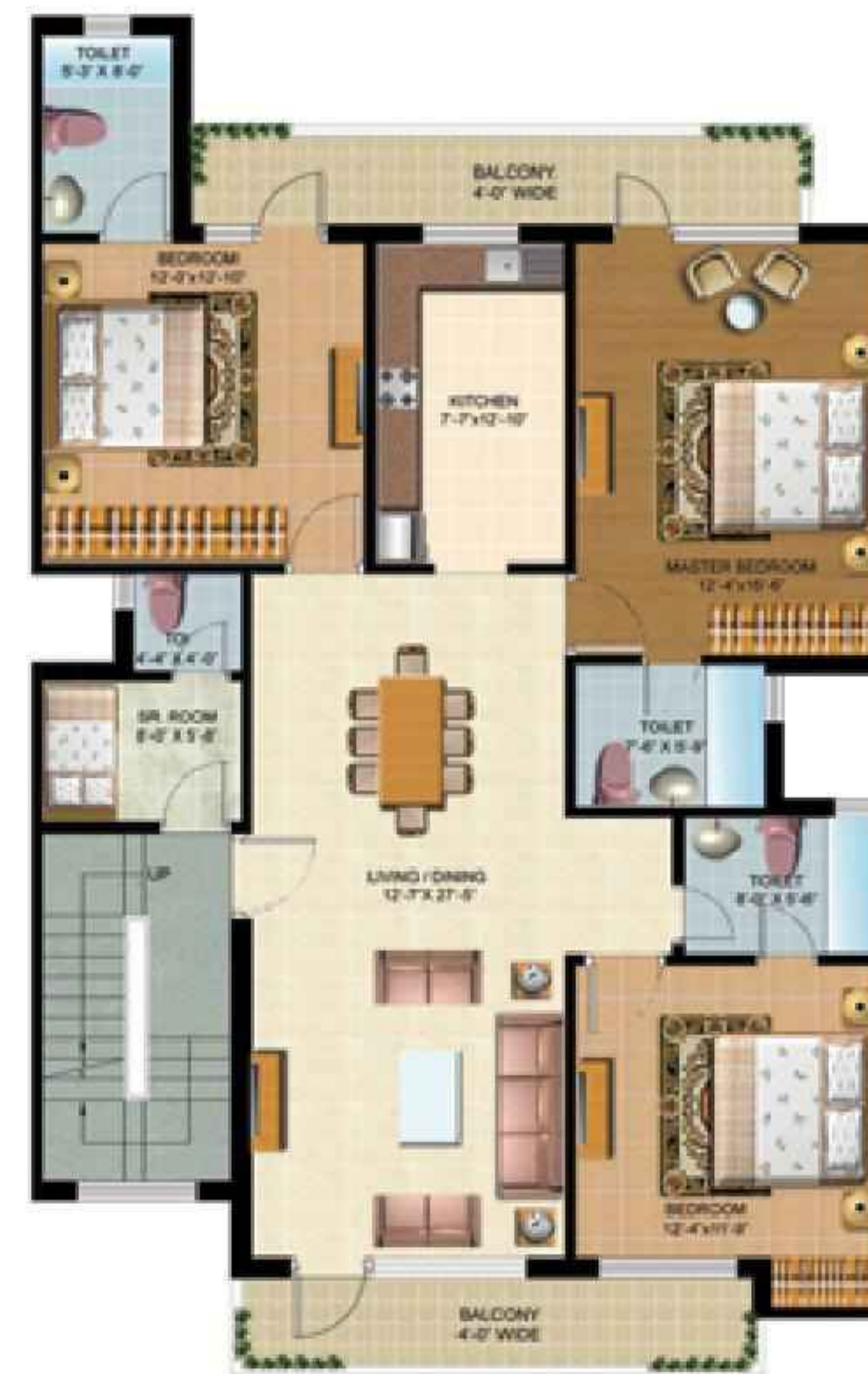
TYPICAL FLOOR PLAN (FIRST & SECOND) SALEABLE AREA/FLOOR: 1725 Sq. Ft.