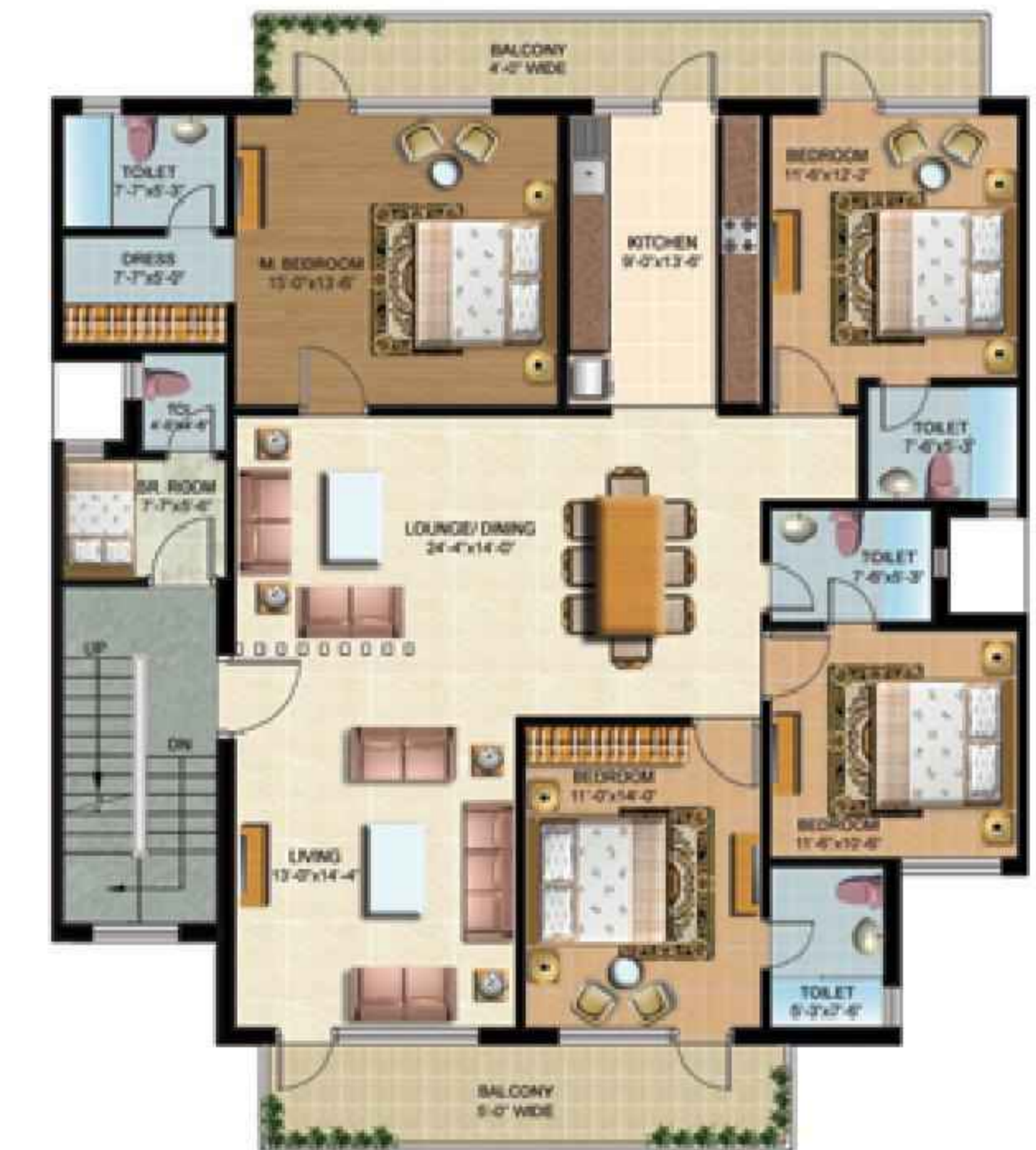
TYPICAL FLOOR PLAN (FIRST & SECOND FLOOR) SALEABLE AREA/FLOOR: 2200 Sq. Ft.

document provided by Anurag Malik 9888-88-3886 www.BuyChandigarh.com