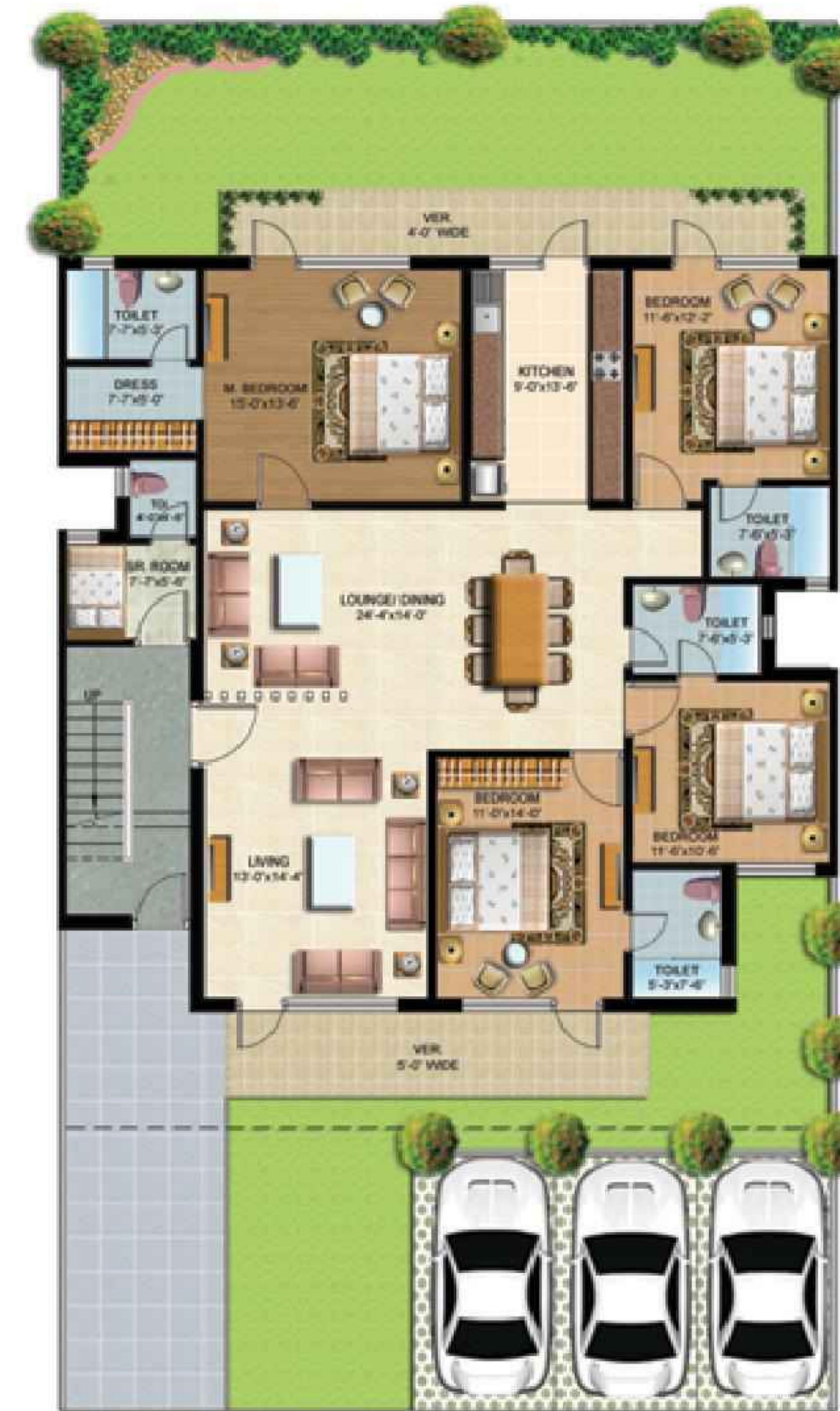
GROUND FLOOR PLAN SALEABLE AREA: 2200 Sq. Ft.